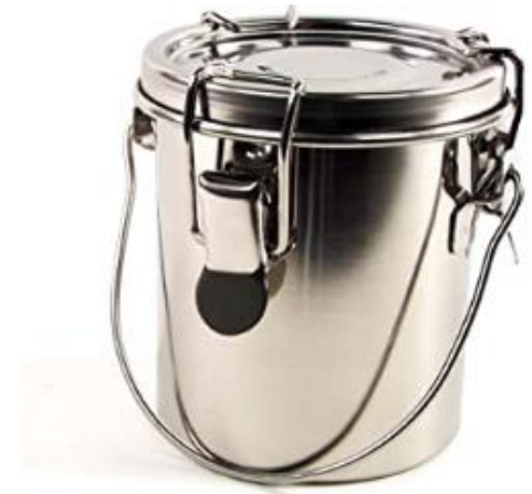
Guerrilla Painter Plein Air 10oz Stainless Steel Brush Washer with...